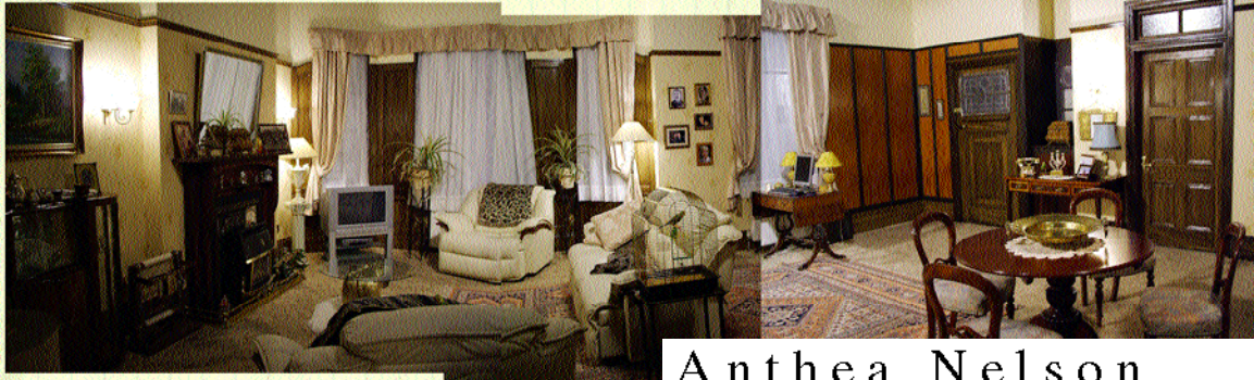
"Uncle Dad" ITV/SMG Productions